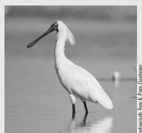
Royal Spoonbill Platalea regia