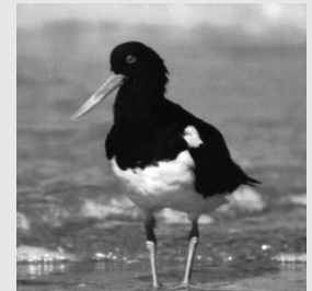
Pied Oystercatcher Haematopus longirostris