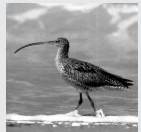
Eastern Curlew Numenius madagascariensis