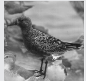
Red Knot Calidris canutus