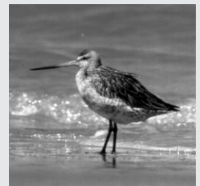
Bar-tailed Godwit Limosa lapponica